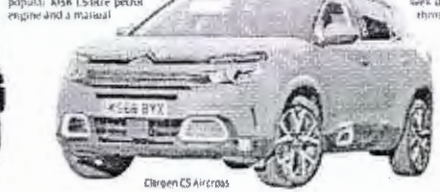
Citroen CS Aircross