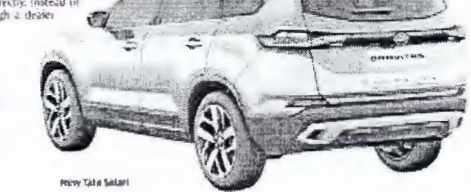
New Tata Safari