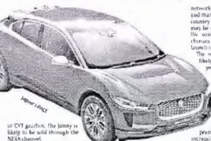
New Tata Safari

Maruti Suzuki's most significant launch during 2021 is likely to be the new Jimny. After much deliberation and delay because of the underlying platform of the Jimny was considered expensive and potentially unsuitable for India, the sheer amount of interest that the vehicle's display at the Auto Expo seems to have convinced the folks at MSIL. If it brings in the same popular 4x4 format that the Jimny is sold in worldwide, it will be one of the smallest SUVs at about 2.4 metres. But given its previous experience with 4x4s and the fact that the market hasn't matured enough to deserve them, Maruti will be re-engineering and marginally redesigning the Jimny into a 4x4 for India. It is likely to be launched with the mighty pop-up 1.6-litre petrol engine and a manual